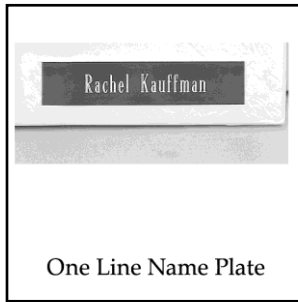
One Line Name Plate