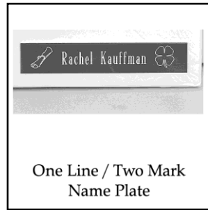
One Line / Two Mark Name Plate