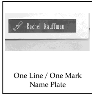
One Line / One Mark Name Plate